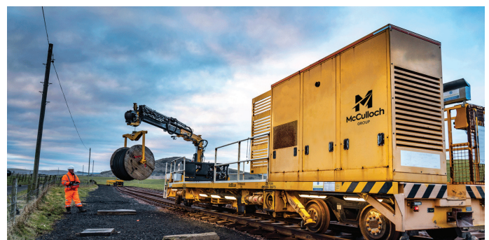
Fig 2: MMPV with crane module unloading cable drums from MMPV deck.