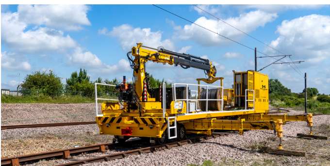
Fig 1: MMPV set up on track.